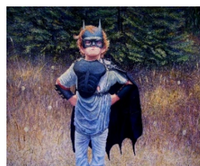
Batboy, 2013, egg tempera on panel, 120cm x 90cm

Waiting to draw my breath, 2017, pastel on paper, 50 x 141cm