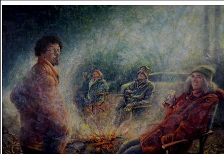
Cold Day for a Bush Picnic (after McCubbin), 2017, egg tempera on panel, 120 x 180cm

In your diary research the egg tempera technique.